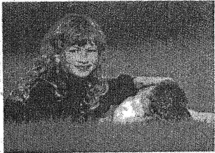
This home is protected by a Zabel Filter.

Zabel Environmental Technology guarantees every Zabel Filter to be free from defects in materials and manufacture for the lifetime of the homeowner-purchaser.