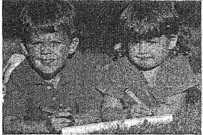
These children are protected by a Zabel Filter.